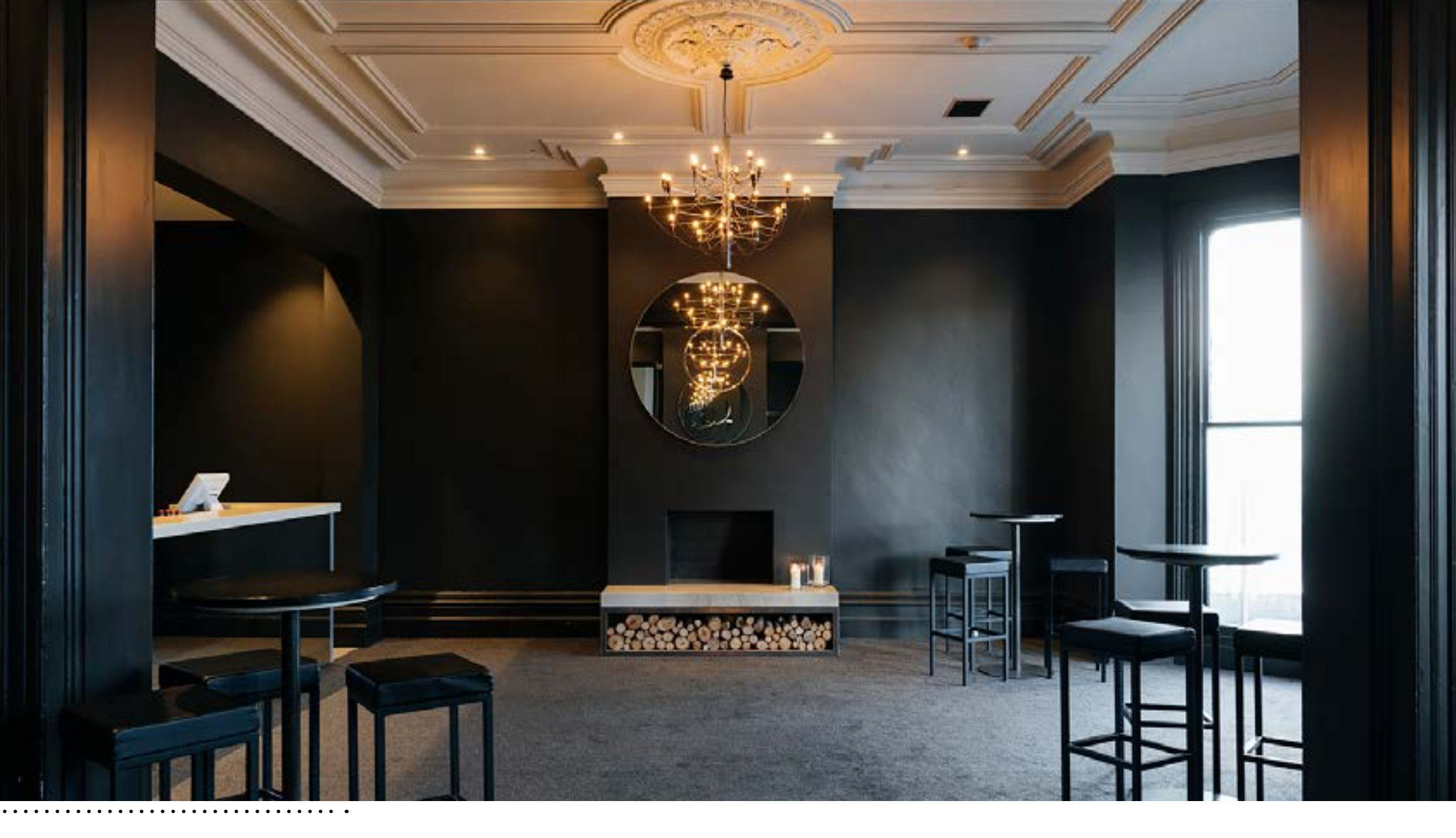
DOWNSTAIRS TERRACE 20 seated | 70 stand-up

Modern, intimate function space with seaside terrace. Ideal for small to medium sized gatherings. Featuring separate sound system, private bar, views of Port Phillip Bay & outdoor terrace with seating.